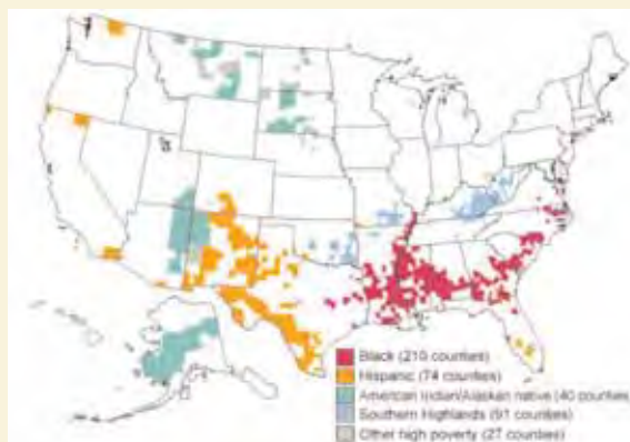
NON-METRO COUNTIES WITH HIGH POVERTY, 2000

NOTE: HIGH POVERTY IS DEFINED AS A POVERTY RATE OF 20% OR MORE.